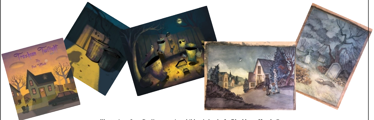
Illustrations from Paul's upcoming children's book: In Blackburn Hamlet ©