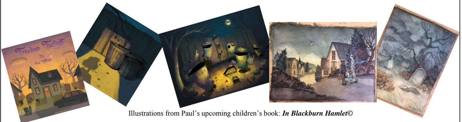
Illustrations from Paul's upcoming children's book: In Blackburn Hamlet ©